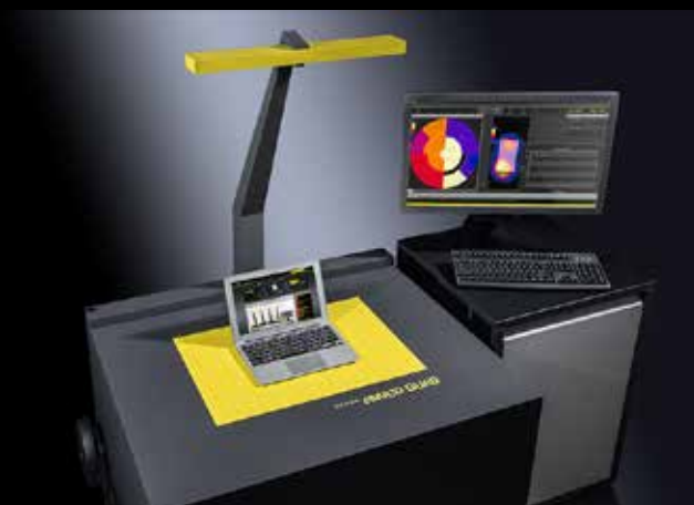
cSAR3D Quad is ideal for measurement of large devices such as laptops and pico base stations.