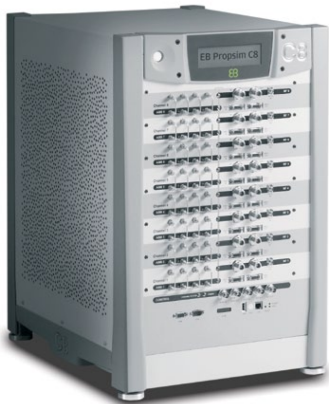
Aircell uses the EB PropSim C8 radio channel emulator in Aircell's own laboratory environment to test the inflight wireless connectivity.