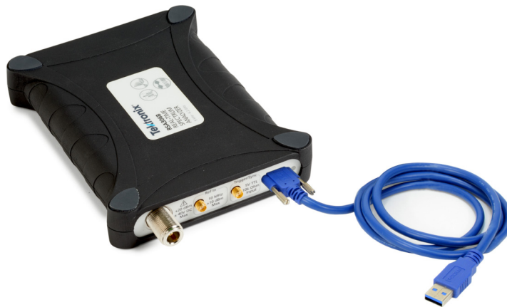
Figure 1: RSA306B Real-Time Spectrum Analyzer

The RSA306B is a portable, 40 MHz Real-Time Spectrum Analyzer that contains an acquisition system inside a small module. The user interface and display resides on a user-provided PC running SignalVu-PC software or a user-developed application. The host PC provides all power, control, and data signals over the USB 3.0 cable included with the instrument. An available software application programming interface is provided to allow you to create your own custom signal processing application.